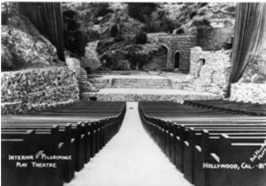
The amphitheatre as it looked in 1922