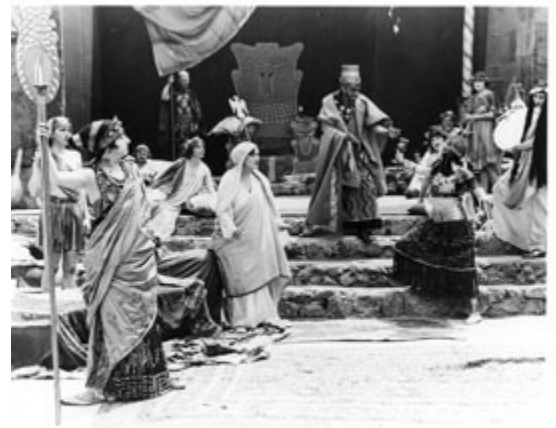
“Salome before Herod” scene from The Pilgrimage Play (1922)

An LED sign for the Ford was installed on Cahuenga last year.