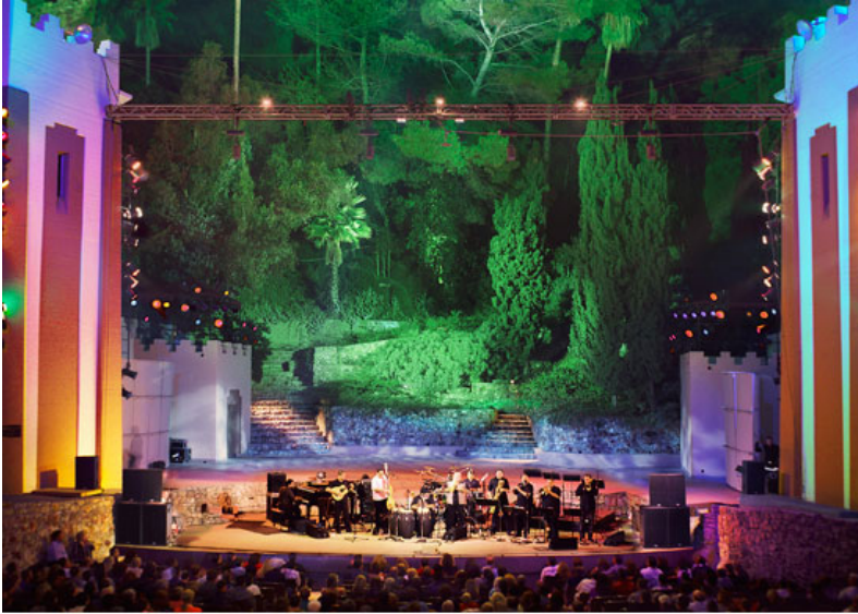
Performance at the amphitheatre/Paul Antico

The Ford Amphitheatre , long in the shadow of its glamorous sibling, the Hollywood Bowl , is gearing up for its own big moment.